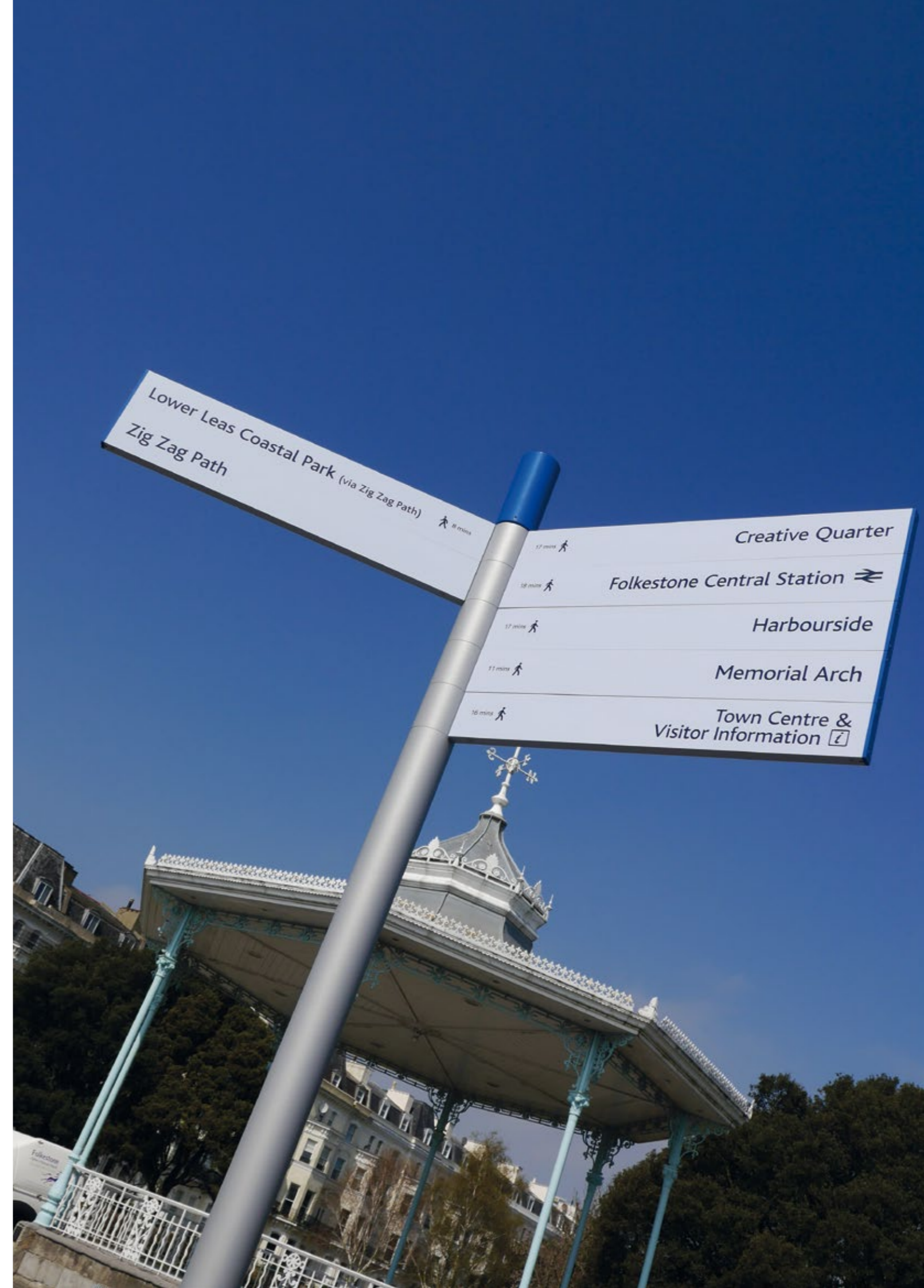
Right Octopus fingerpost at Folkestone

Octopus is suitable for town centres, business parks, hospital and university campuses or anywhere that pedestrians require directions.